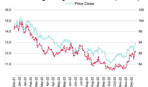
Sino Thai Engineering & Construction Plc (STEC TB)